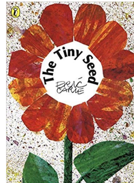
The Tiny Seed Eric Carle