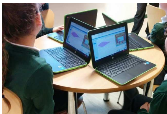
Coding Club has proved to be very popular in Key Stage 2