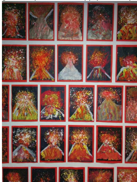
Year 3 have produced some excellent volcano paintings as part of their topic work.